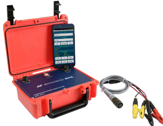
EDI-54V Vibrating wire indicator

The model EDI-54V vibrating wire indicator is a microprocessor-based read-out unit for use with Encardio-rite's range of vibrating wire sensors. It can display the measured frequency in terms of time period, frequency, frequency squared or the value of measured parameter directly in proper engineering units. It uses a smartphone with Android OS as readout having a large display with a capacitive touch screen which makes it easy to read the VW sensor.